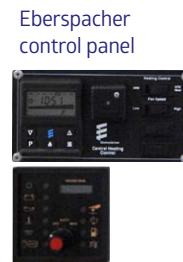
Eberspacher control panel