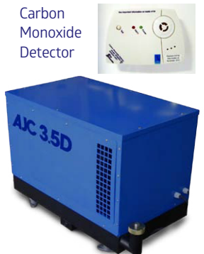
Carbon Monoxide Detector