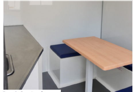
Bench Seating for 6