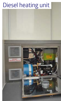
Diesel heating unit