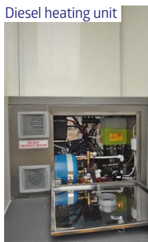
Diesel heating unit