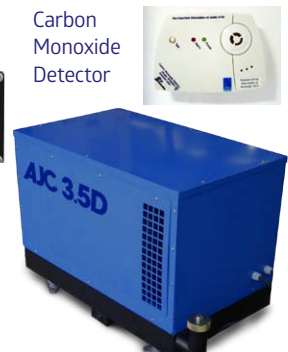
Carbon Monoxide Detector